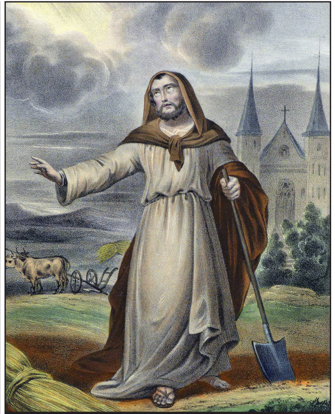
May 15: St. Isidore "Sir, I work alone and know of none save God to whom I look for strength."